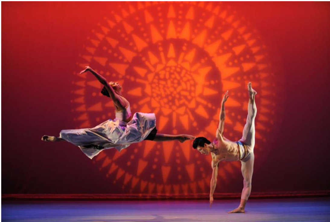
Ailey II in Alvin Ailey's Isba.